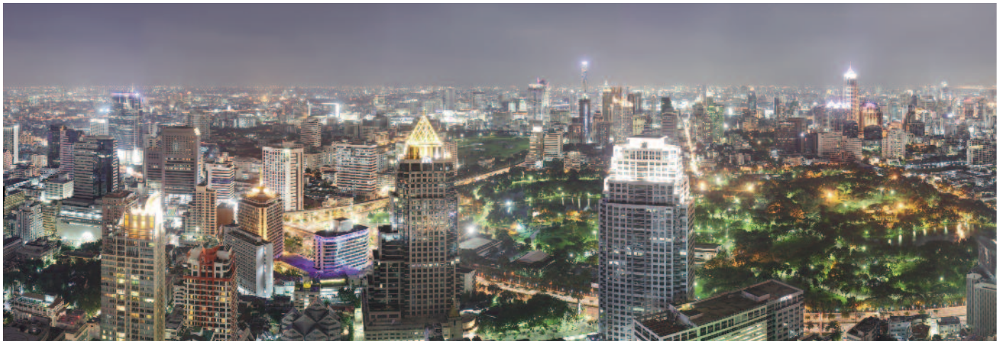
Bangkok, Thailand at night.