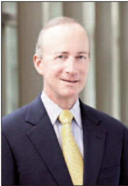
Indiana Governor Mitch Daniels

The Great Lakes are an economic engine of our States, our region and our nation. By protecting and leveraging this resource, the Great Lakes Governors are working to increase the competitiveness of our region's people and industry. We are committed to creating jobs and economic opportunities through foreign trade and regional collaboration.