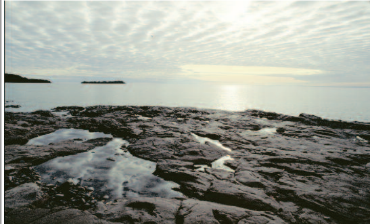
Lake Superior's North Shore.

— Mitch Daniels Co-Chair, Council of Great Lakes Governors Governor, State of Indiana