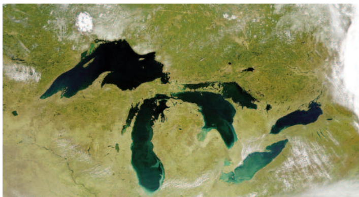
The Great Lakes as seen from space.

IAGLR is a scientific organization made up of researchers studying the Laurentian Great Lakes, other large lakes of the world, and their watersheds, as well as those with an interest in such research. For more information visit: www.iaglr.org